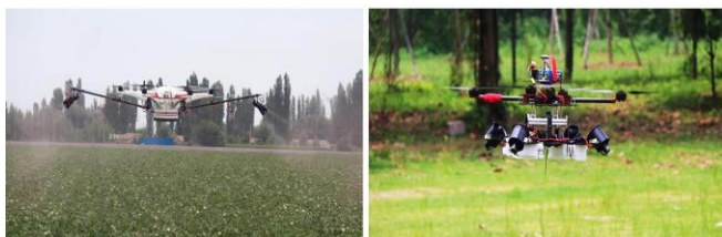
Figure 2 Aerial air-assisted spray for plant protection UAV

China) and has a similar spraying effect, as shown in Figure 2. Droplets are transported to the target crops by directional airflow generated by ducted fans under UAV, and smaller droplets are easier to deposit under the assisted influence of airflow, reducing droplets drift and environmental pollution.