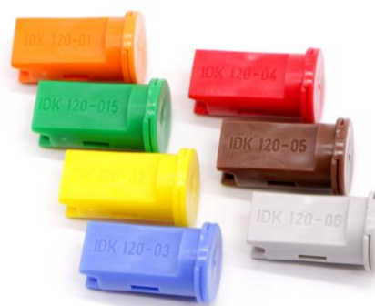
Figure 3 IDK series drift reducing jet nozzles