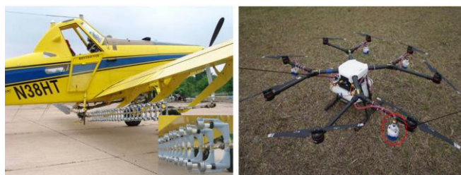
a. Electrostatic spray system for manned aircraft [62] b. Electrostatic spray system for UAV

Note: Electrostatic nozzle was marked in the red circle in Figure 1b.