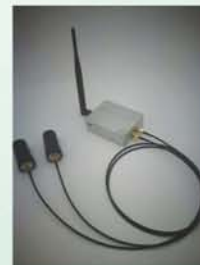
Spraying Quality on-line Monitoring System