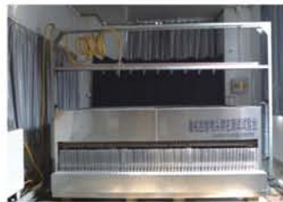
Precision Test Bench for Nozzles Spray Distribution