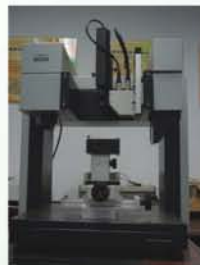
DSA100 Contact Angle Measuring Meter