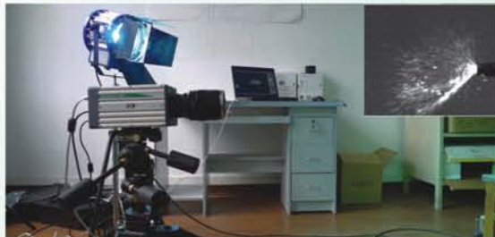
High Speed Dynamic Analyzer