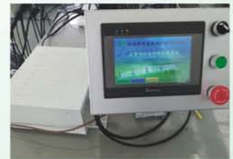
Suspension Active Controller of Spray Boom