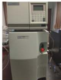
Water1525 Liquid Chromatograph