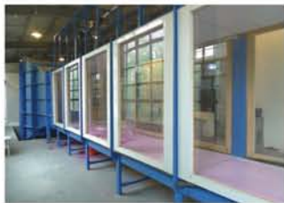
Wind Tunnel for Crop Protection

The center has established Sino-US Joint Pesticide Application Technology Laboratory, International Research Center of Precision Agricultural Aviation Application Technology, NRIAM Branch, Jiangsu Province Pesticide Application Technology and Equipment Engineering Research Center and other national/provincial research platforms. The center has developed a number of international level experimental and test platforms including the wind tunnel for crop protection, the six freedom-degree motion test platform, the nozzle precision spray test bench, the UAV rotor wind field test bench and the rotor wind field simulation test bench. The center is equipped with high-precision data collection & processing instruments including LAI-2200C canopy analyzer, PSR1100F ground spectrometer, MotionPro X3 high speed camera, DSA100 contact angle measuring instrument, Water1525 liquid chromatograph, V-5100 visible spectrophotometer, DP-02 laser particle size analyzer and the ADCLite multispectral camera system, etc.