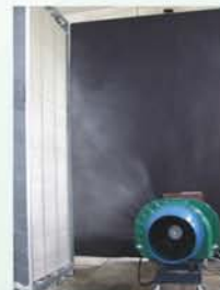
Vertical Spray Distribution Test Bench