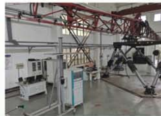
6-DOF Motion Simulation Platform