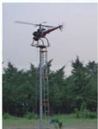
UAV rotor wind field test platform