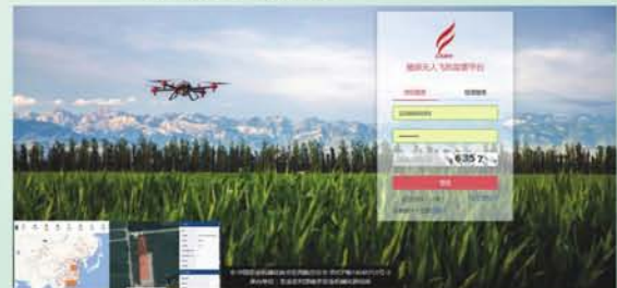
Cloud Monitoring Platform for Crop Protection UAV