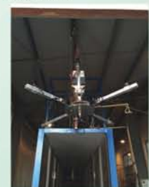
UAV Wind Field Simulation Platform