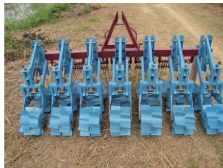
Figure 3 Developed mechanical weeder

conventional rubber wheel tractor (Kubota B2420, 24hp). The original purpose of modification was to attach a paddy field chemical boom sprayer, as its narrow wheels can travel in paddy fields without destroying the rice plants. After conversion, the specifications changed as follows: weight: 820 kg in total, 515 kg at the front and 305 kg at the rear; wheel width: 10 cm; front- and rear-wheel radii: 49 and 74 cm, respectively; center of gravity: 98.16 cm longitudinally ahead and 4.95 cm vertically above the rear axis. The narrow steel wheel tractor with the developed weeder attached is shown in Figure 4.