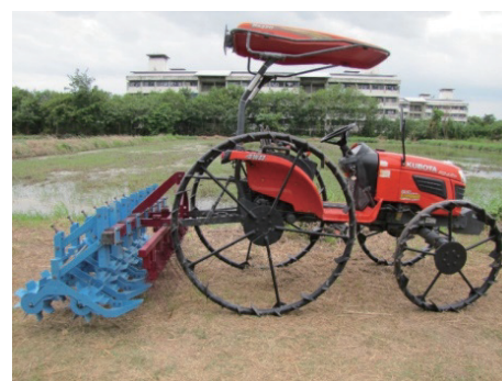
Figure 4 Narrow steel wheel tractor with the developed weeder