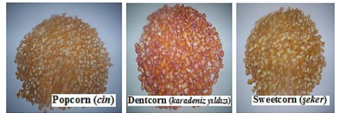
Figure 1 Hybrid maize varieties used in research

test, the required quantity of samples were taken out of desiccators and allowed to warm up to room temperature.