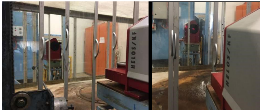
Note: The Helos laser diffraction system was mounted 51 cm horizontal distance in downwind direction from the nozzle, a distance for the sufficient breakup of the liquid sheet. The spray clouds were oriented perpendicular to the laser beam and crossed the laser beam when measuring.

Comparing to the field test, wind tunnel test can simulate the field conditions and has the outstanding advantages of repeatable, consistence, easy accessibility, and short sampling periods, therefore, wind tunnel test has been widely used for developing of models in pesticide spraying study[21]. The tests of this study were carried out in the Centre for Pesticide Application and Safety (CPAS) Wind Tunnel Research Facility at the University of Queensland in Gatton, Queensland, Australia. The arrangement of wind tunnel facilities is shown in Figure 1.