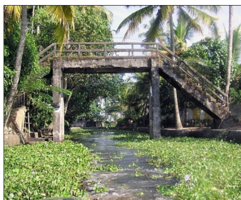
Figure 2 Waterways choked with water hyacinth

Among the multiple factors causing the aquatic weeds' growth, the geographical and climatic factors like topography, depth of water bodies, extent of silting and water qualities are the most important. International experience [14,15] shows that the plant's reproductive capacity, adaptability, nutritional requirements and resistance to adverse environments make it impossible to eradicate, and difficult to control.