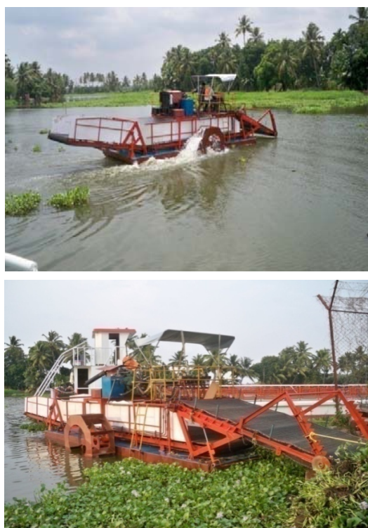
Figure 11 Aquatic weed harvester developed by M/s Kelachandra Precision Engineers, Kottayam, Kerala

The harvester developed by M/s Kelachandra Precision Engineers, Kottayam, Kerala (Figure 11) consists of a steel barge fitted with conveyor belts and is driven by a marine diesel engine of sufficient capacity for operating the hydraulic system. Navigation is by