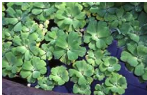
Figure 3 Pistia stratiotes

perennial or annual, usually seen in fresh water bodies, brackish water or salt water. They propagate by berries, seeds or detached rosettes, mostly dispersed by water but fruits may be eaten by animals and spread the seeds.