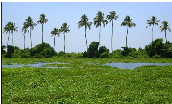
Figure 8 Weeds attacked waterways of Kumarakom, Kerala

Aquatic weeds occurring in flooded rice fields and other arable lands constitute a serious menace to agriculture. In agriculture, the weeds cause huge reduction in crop yields, increase the cost of cultivation, reduce input efficiency, interfere with agricultural operations, impair quality, and act as alternate hosts for several insect pests, diseases and nematodes. They compete with crop plants for various inputs/resources like water, nutrients, sunlight etc [16] . They are not only potential sources of invasion to croplands, but cause flooding, seepage, evapo-transpiration loss, decreased water delivery and silting in irrigation channels [17] . Invariably aquatic plants become over abundant or unsightly and require control [18] .