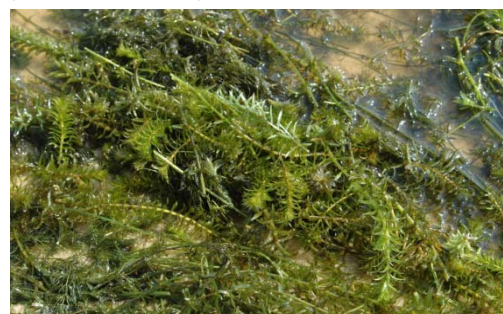
Figure 7 Hydrilla verticillata

It is one of the most notorious submerged aquatic weed forming masses growing in static or slowly flowing water, often very abundant and dominant in large areas. It is a submerged perennial herb rooted with long stems that branch at surface where growth becomes horizontal and dense mats form. Thick mat like growth block sunlight penetration to native plants growing below. It seriously affects water flows and water use. Its heavy growth may obstruct boating, swimming and fishing in lakes, rivers and blocks withdrawal of water used for power generation and agricultural use.