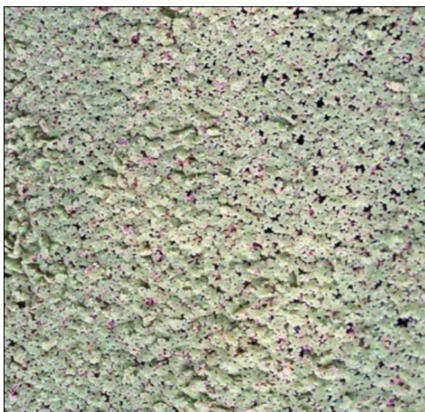
Figure 5 Azolla pinnata infested water bodies

It is a pest of waterways because its dense mats reduce oxygen in the water. The weevil Stenopelmus rufinusus is used as an agent of biological pest control to manage Azolla filiculoides , and it has been found to attack A. pinnata as well. Rice farmers sometimes keep this plant in their paddies because it generates valuable nitrogen via its symbiotic cyanobacteria. The plant can be grown in wet soil and then ploughed under, generating a good amount of nitrogen-rich fertilizer. The plant has the ability to absorb a certain amount of heavy metal pollution, such as lead, from contaminated water. It is 25%-30% protein and can be added to chicken feed.