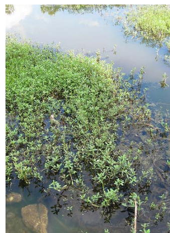
Figure 4 Alternanthera philoxeroides

Most of the species are found in tropical warm regions of the world. It a perennial herb, stem often forming tangled masses in water or along the shore. It is regarded as a valuable food for live stock particularly pigs, used as green manure, vegetable and in medicine.