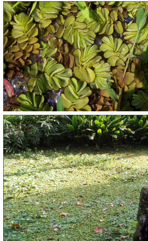
Figure 1 Salvinia molesta infested water bodies

intertidal zones, thus affecting the littoral fauna. The inshore benthic community is also affected to a great extent by the settlement of dead and decaying Salvinia .