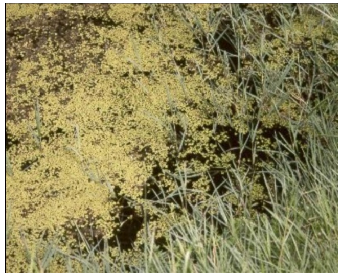
Figure 6 Duckweed infested water bodies

6.5 and 7.5, and temperatures between 6°C and 33°C. Growth of colonies is rapid, and the plant frequently forms a complete carpet across still pools when conditions are suitable. It is an important food resource for many fish and birds (notably ducks) because it is rich in protein and fats. Birds are also important in dispersing the species to new sites; the root is sticky, enabling the plant to adhere to the plumage or feet while the bird flies from one pond to another.