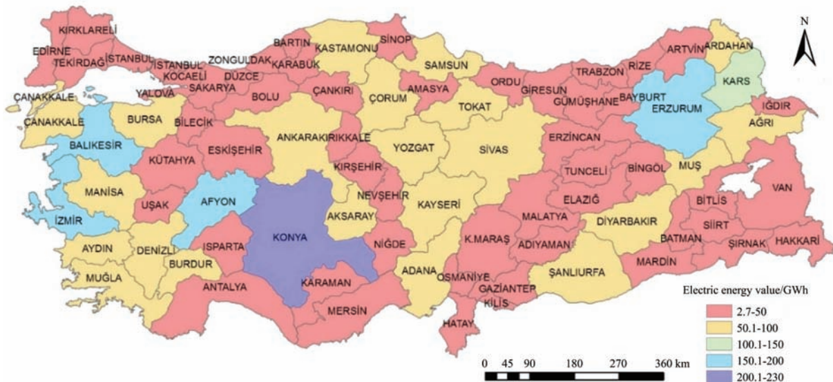
Figure 2 The map of electricity production from biogas in Turkey