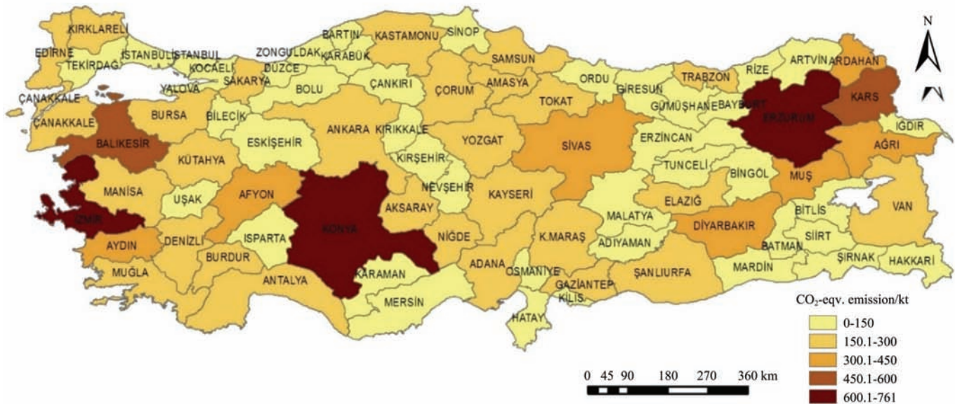
Figure 3 Map of CO 2 equivalent emission caused from animal manure by province in Turkey